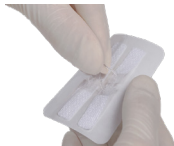
Figure 2 - Pick