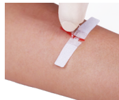
Figure 3 - Place