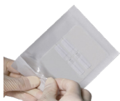
Figure 1 - Open