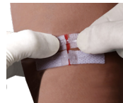
Figure 4 - Pull

Adjusting the opening (e.g., expanding the gap between the sides of the device) before application so that the edges of the adhesive can reach the wound's edges (without extending into the center of the wound) may require touching of the device adhesive; if so, minimize the touching to preserve the robustness of the adhesive.