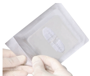
Figure 1 - Open