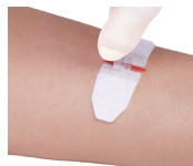
Figure 3 - Place