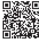
Link to Training Videos (via DermaClip Website)

Document: DCUS-IFU-LC1U-0009 (250x175) DCUS P/N: 12003 Rev.1 (9) (250x175)