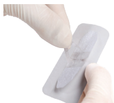
Figure 2 - Pick