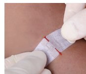
Figure 4 - Pull

Adjusting the opening of the devices (e.g., expanding the gap between the sides of the device) before application so that the edges of the adhesive can reach the wound's edges (without extending into the center of the wound) may require touching of the device adhesive; if so, minimize the touching to preserve the robustness of the adhesive.